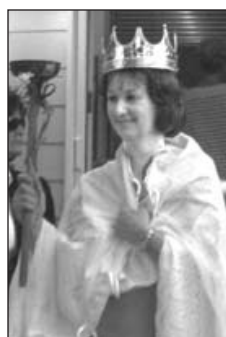
The Royal ankles were attacked by masked marauders.

OVER ACHIEVERS ANONYMOUS. After over achievers complained, there's added work in the cards for the retreat this year. One bass says he doesn't mind the work, but there'd better be a big crowd remaining in Dittmer at 4 p.m. on Saturday.