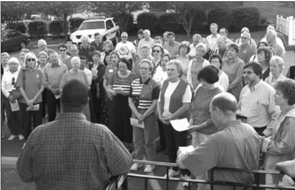
World Day of Prayer was observed with a special Thursday evening ceremony in front of the Manchester, Mo. City Hall on May 2. About 50 members of the Chancel Choir joined a few area residents to sing hymns and pray.